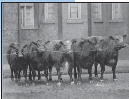
Winners of the Ag College Special International 1921 "Bred and fed at the University Farm"

The General Library serves as the principle location to do research and study on the UC Davis Campus and beyond. As a Research I institution the UC Davis Library fully supports the research needs of the Colleges of Agricultural and Environmental Sciences, Biological Sciences, Engineering, and Letters and Science. In addition to the standard degree granting programs, UC Davis supports professional schools in Management, Education, Law, Medicine, and Veterinary Medicine.