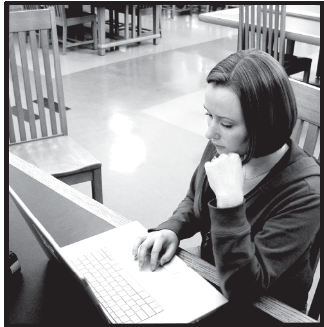
Contemporary library patron, image not in archives

The UC Davis librarians and staff are highly educated and dedicated to providing assistance to our patrons. All front line service points (the circulation, reserves, and reference desks) as well as the Systems Office, Technical Services, and other "back room" operations are seeking ways to continually improve how we serve the needs of our scholars.